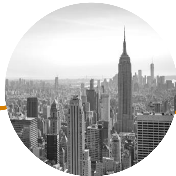
NEW YORK Jul 2017 Commercial Launch NYC Office