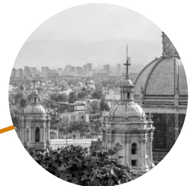
MEXICO CITY May 2019 Launch FH MEX; Established Mexico Location