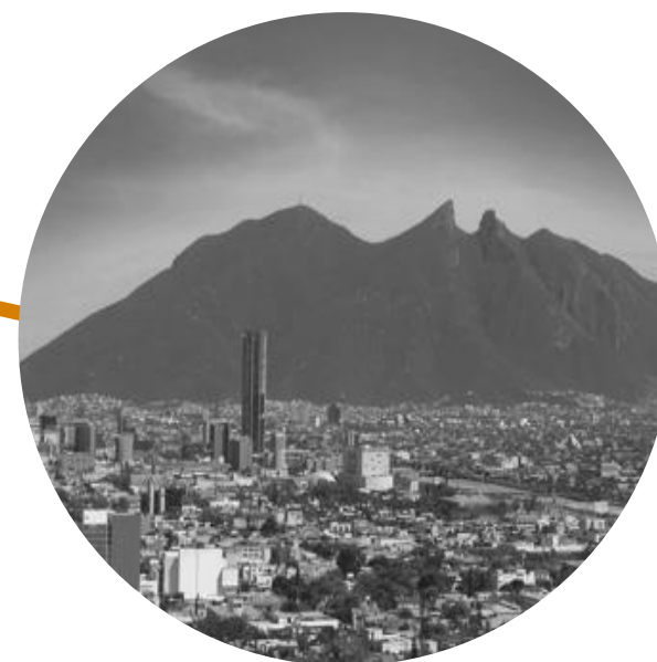
MONTERREY Feb 2018 Established Mexico Office