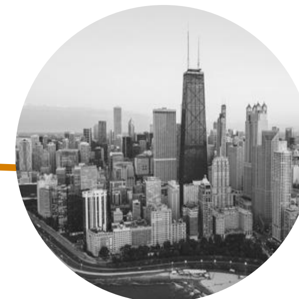
CHICAGO Jan 2019 Established Chicago Location