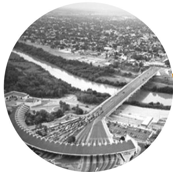
LAREDO 2015 Company Formed

Fr8Hub was created to simplify the process of cross-border shipping. The founders of Fr8Hub go back many generations in the logistics industry in Laredo, Texas, now the largest land port in the USA.